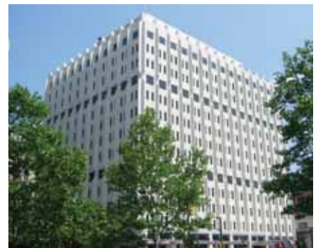
The Air Rights Center Bethesda, MD