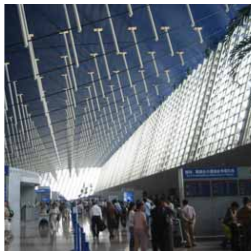
Shanghai Pudong International Airport Shanghai, China