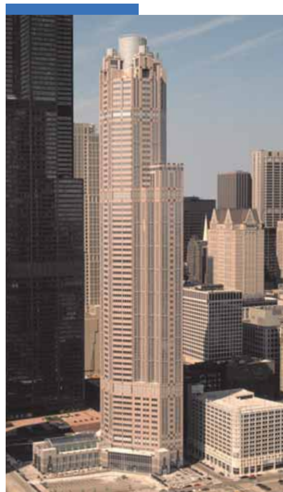
311 S. Wacker Chicago, IL

EWC24 – Premium formulation elastomeric with internally plasticized resins providing +300% elongation. Available in White, deep, and neutral bases, smooth and sand texture finishes.