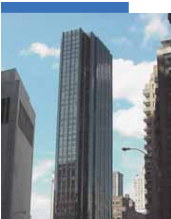
Trump International Hotel New York, NY