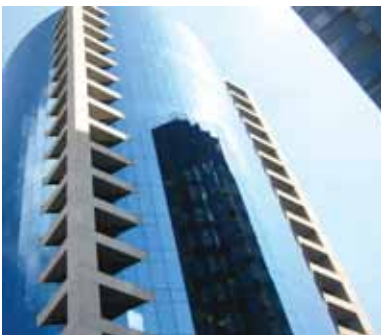
Droll Tower Mexico City, Mexico