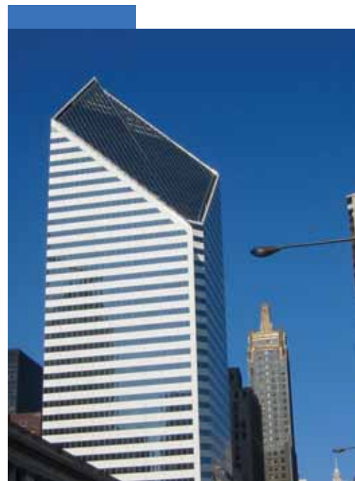
150 North Michigan Avenue Chicago, IL